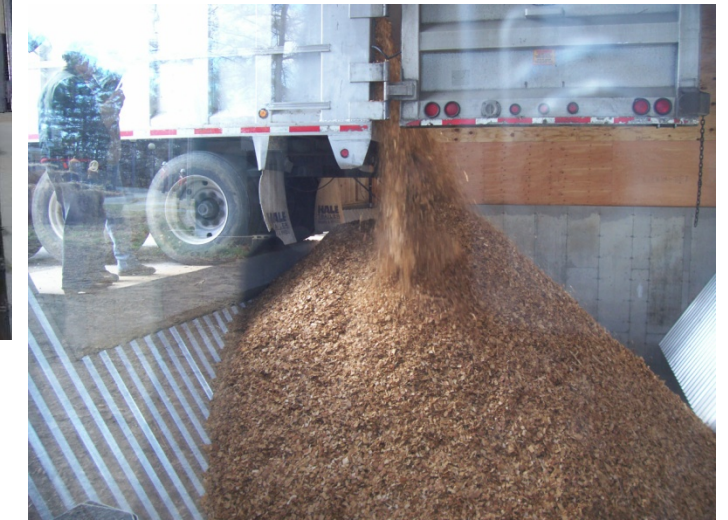
Proctor Academy, Andover, New Hampshire – 10,000,000 btu/hr, 300psi Steam Unit