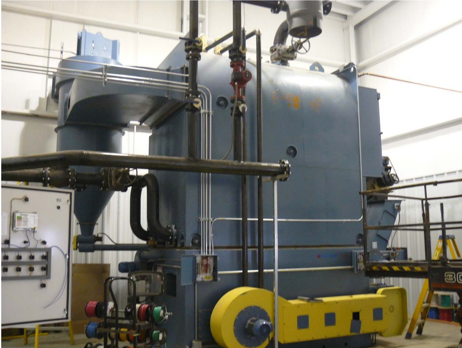
Summit Hardwoods, Millersburg, Ohio, Lumber Drying Kiln -- 2,077,000 btu/hr, 150# Steam