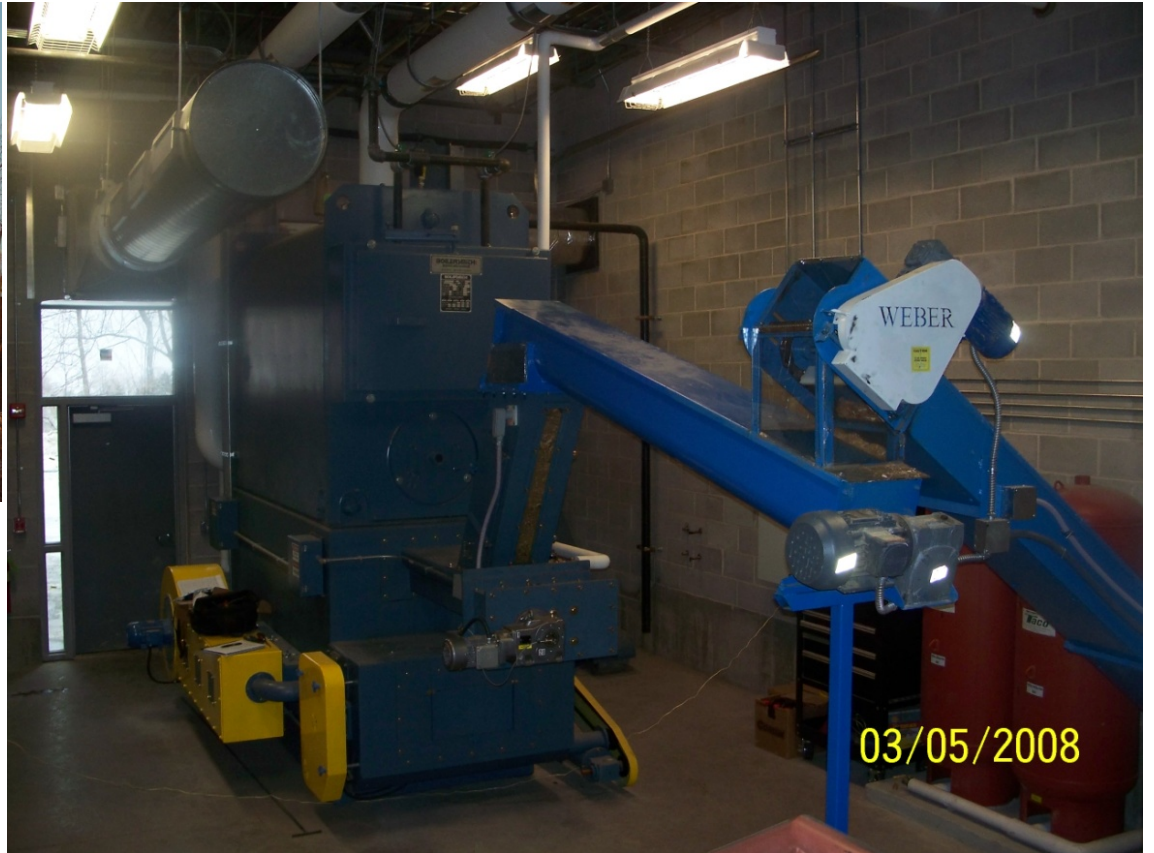
The Danville School, Danville, Vermont 2,077,000 btu/hr 30# Hot Water