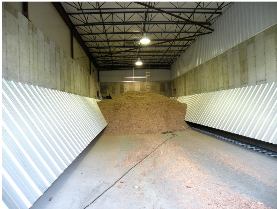
Geremia Greenhouses, Wallingford, CT --- Two 5,800,000 btu/hr 30# Hot Water Units